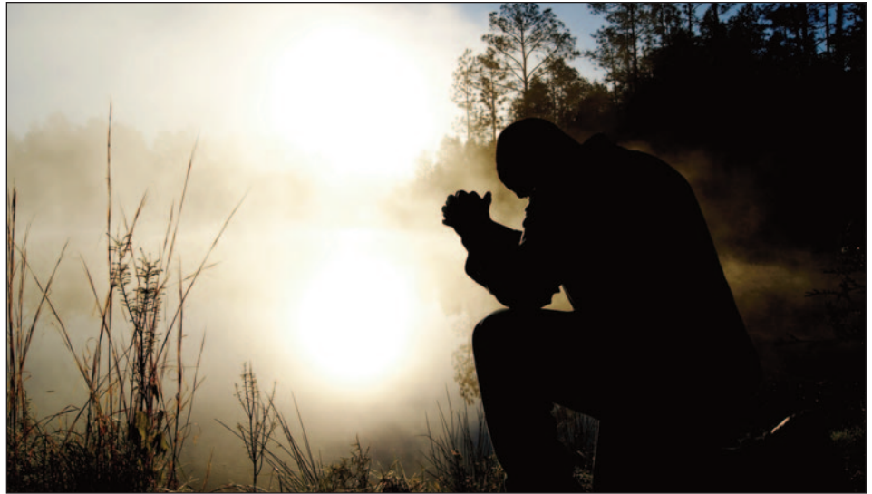
Hear our prayer, O Lord.

been having some health issues and asks for your prayers as she seeks treatment.