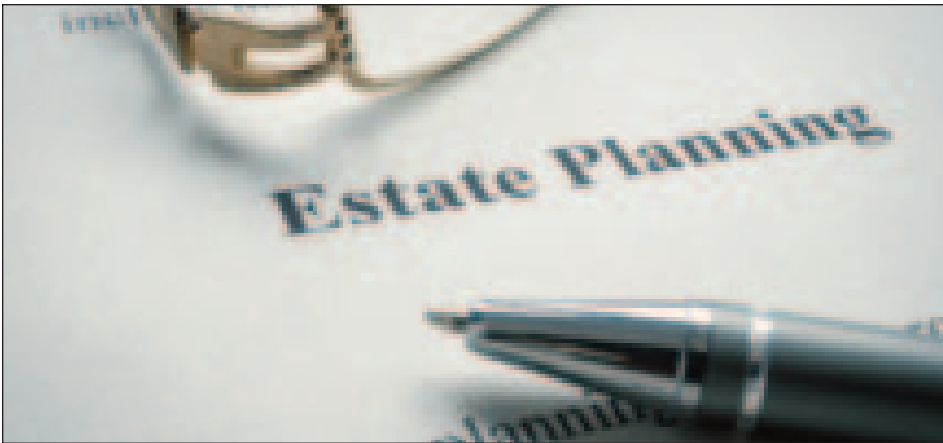
Consider making OSL part of your estate planning.